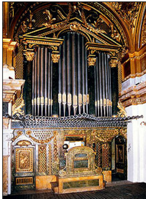
Palacio Real, Madrid, 1778

Please be assured that Accolades continually monitors industry events, such as airline strikes and bankruptcies, etc. If any such events affect your tour, you will be notified. At the time this tour was developed there was not a U.S. State Department Travel Warning in effect for this destination; please refer to the following website for current information or call Accolades. http://travel.state.gov/travel/cis_pa_tw/tw/tw_1764.html