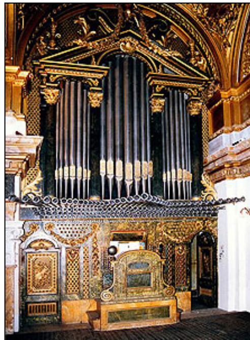
Palacio Real, Madrid, 1994

Please be assured that Accolades continually monitors industry events, such as airline strikes and bankruptcies, etc. If any such events affect your tour, you will be notified. At the time this tour was developed there was not a U.S. State Department Travel Warning in effect for this destination; please refer to the following website for current information or call Accolades. http://travel.state.gov/travel/cis_pa_tw/tw/tw_1764.html